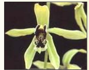
C. 'Green Dragon Chelsea'

There are other notable orchids in the C. genus, like C. lawrenceana from Southeast Asia with thin sepals, yellow-green flowers and a large, white lip with a richly-colored center. Also of note is C. mooreana 'Brockhurst' which produces the largest (three-inch) white flowers in this genus, and is represented by propagations from a single clone imported from Vietnam over 100 years ago.