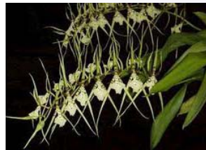
Brassia rex "Sakata"

Orchids, like humans, are affected by stress, generally in a negative way. For example, an orchid stressed by too much sunlight, polluted or stale air, low temperatures or overly wet conditions might pick up a viral disease manifested by black spots or streaks or yellow mottling on its leaves. In turn, the virus can be transmitted to healthy orchids, especially cymbidiums, by sap-sucking pests like the red spider mite. A diseased orchid should be grown in isolation and all tools used on it, like knives and scissors, should be sterilized to protect healthy orchids.