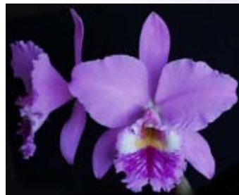
Cattleya labiata venosa estriata

Cattleyas from Latin America were the earliest of the tropical epiphytic orchids to be grown and flowered by humans, beginning with Cattleya labiata in 1818. C. labiata comes from the mountainous forests of Brazil. Cattleyas are closely related to genera such as Brassavola , Encyclia , Laelia and Sophronitis .