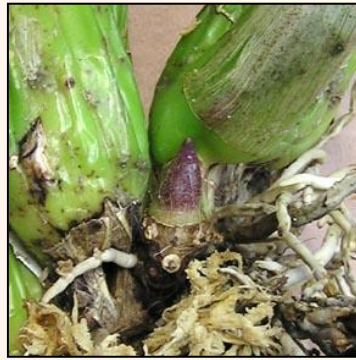
Active eye at the base of pseudobulb