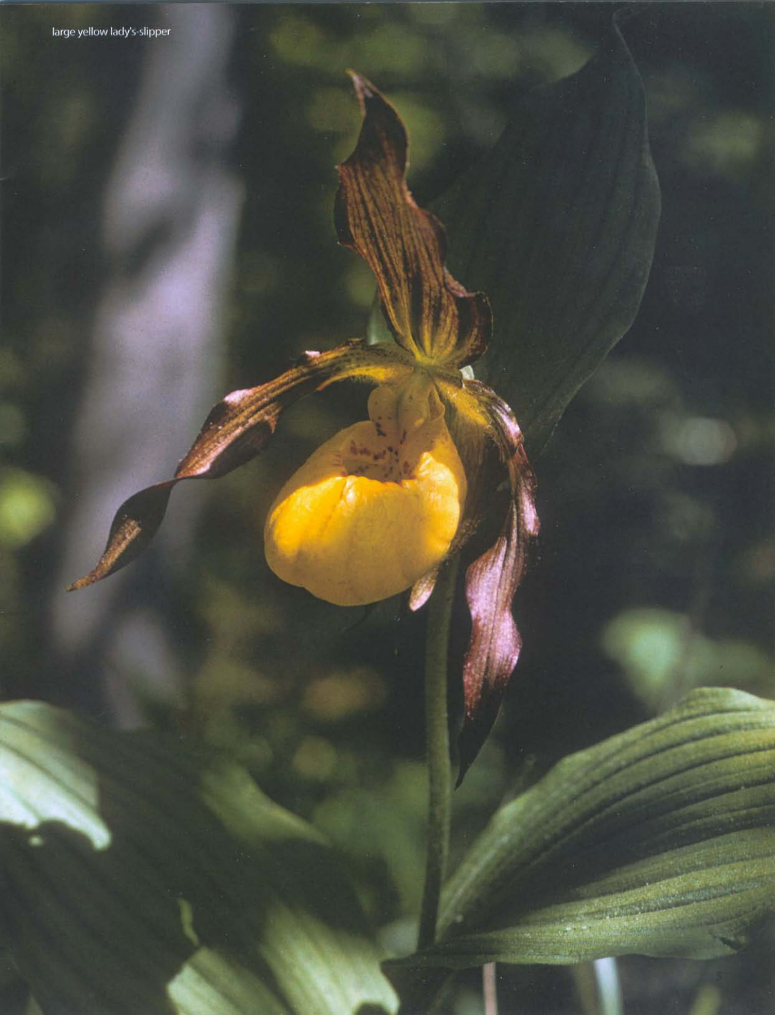
large yellow lady's-slipper