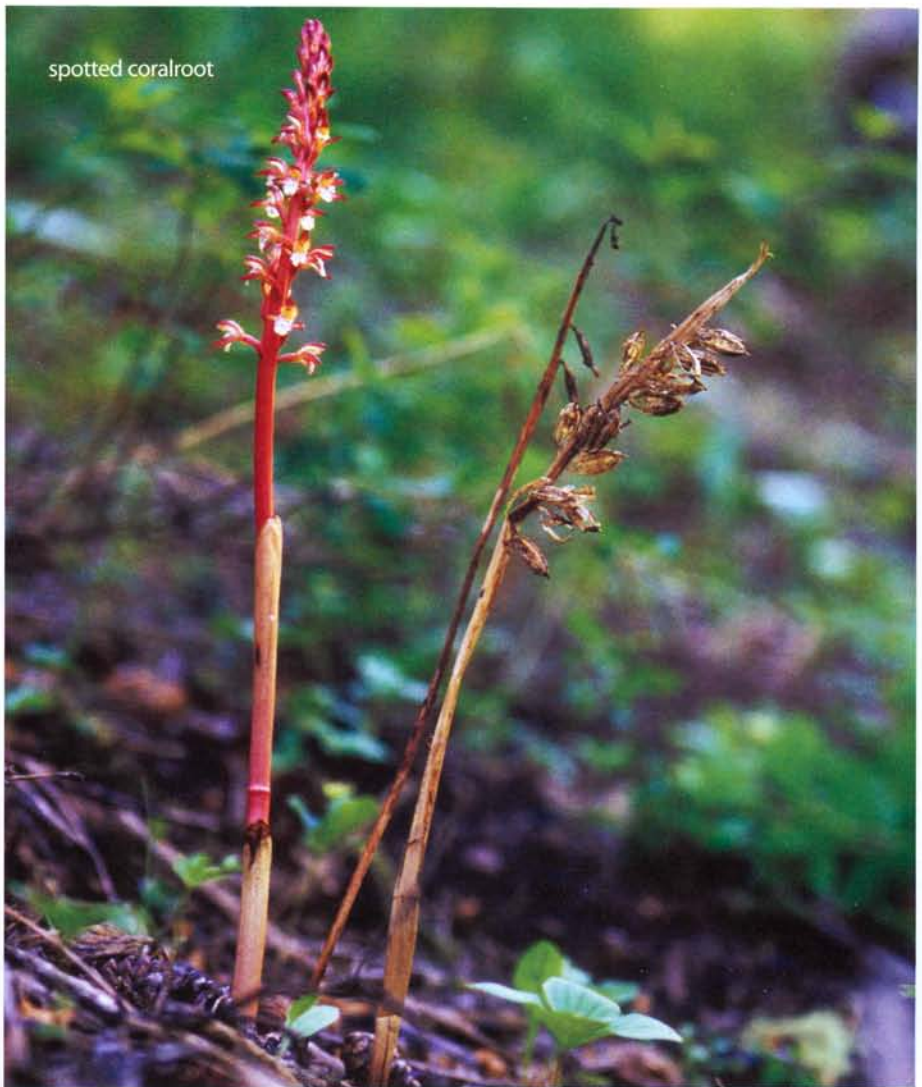
Spotted coralroot Corallorhiza maculata

While some orchids are common, there are 20 species of orchids that are considered endangered or threatened in New York