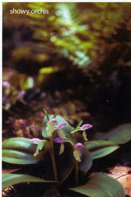
Showy orchid Galearis spectabilis

New York State Conservationist, June 2010