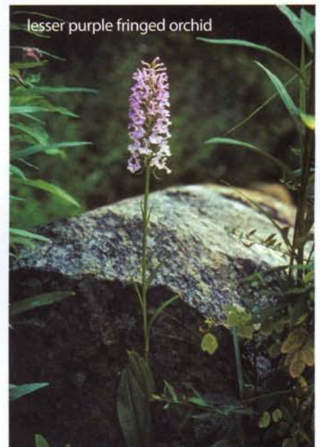
Lesser purple fringed orchid Platanthera psycodes

Habitat: Margins of streams, swamps, marshes and wet low forests.