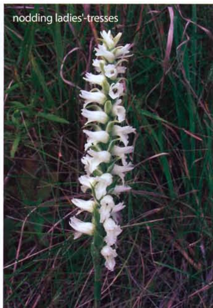
Nodding ladies'-tresses Spiranthes cernua

Questions like, "What caused the decline of Hooker's orchid?" justify the great interest in these wonders of the plant kingdom. Wild orchids often generate excitement due to their reputation as rare and exotic plants. Indeed, the more that is learned about them, the more fascinating they become. Consequently, that