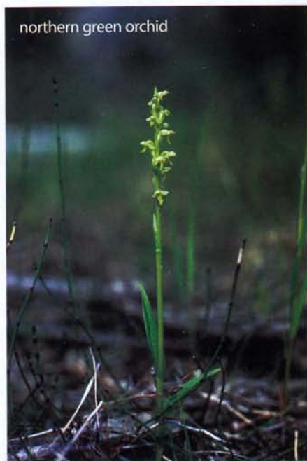
northern green orchid