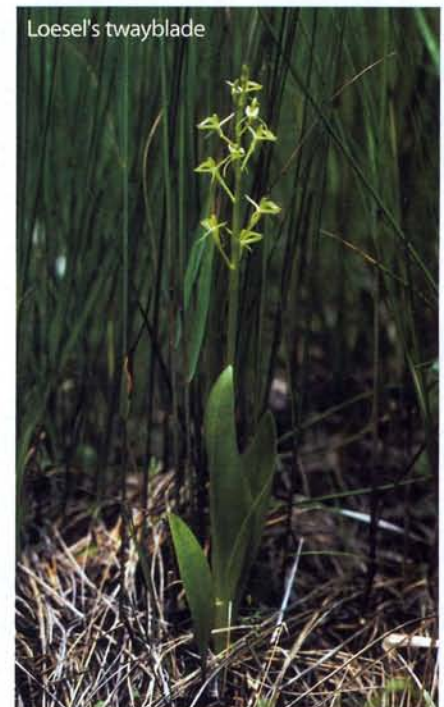
Loesel's twayblade Liparis loeselii

the rim of the flower) and three petals. However, orchids have one petal that is different from the others; called the lip. In addition, while irises have three stamens (male flower parts) and a pistil (female flower part), in orchids these parts are fused into a single structure called the column (see diagram on pg. 7). The column